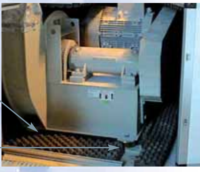
Fan mounting and acoustic enclosure