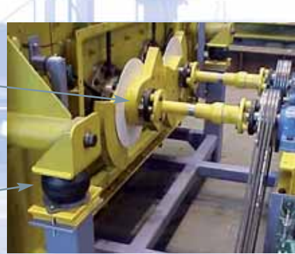
Anti-vibration mounts and flexible couplings on a hopper